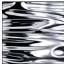
0938010A Diffuser Moulded and mirror-treated aluminium diffuser