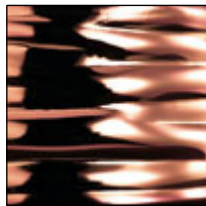
0938020A Diffuser Moulded and mirror-treated aluminium diffuser