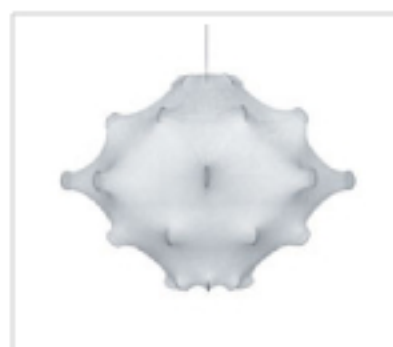
Taraxacum 2 design by Achille Castiglioni and Pier Giacomo Castiglioni

Suspension lamp providing diffused lighting