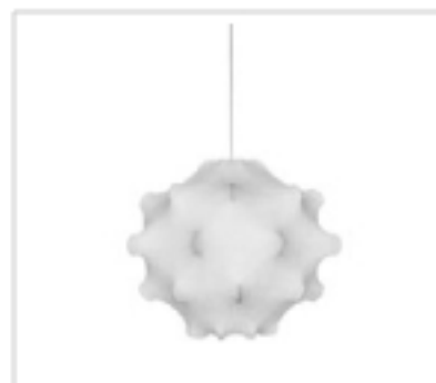
Taraxacum 1 design by Achille Castiglioni and Pier Giacomo Castiglioni

Suspension lamp providing diffused lighting